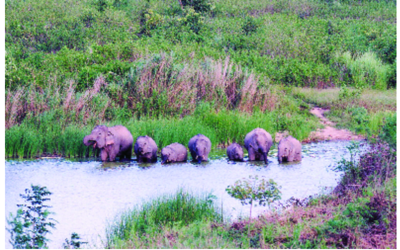
Elephants cool off in a pond at Kui Buri.

or working with villagers to introduce community-based tourism which mitigates the loss of income.