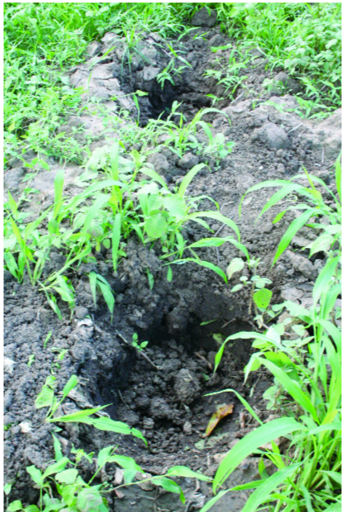
Below: The tell-tale sign of elephant prints in a field outside Salak Pra.

'This initiative we've got going is worthwhile, human/elephant conflict is growing and we're working at the cutting edge. If we can find a solution that works it's a solution that can be tried elsewhere. An awful lot of what we're doing is about people. I love elephants, but it's not all about them. People make the difference.' V